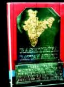
RASHTRIYA RATTAN AWARD