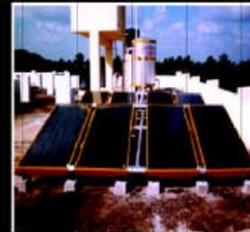
1000 LPD SOLAR WATER HEATER