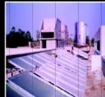
5000 LPD SOLAR WATER HEATER